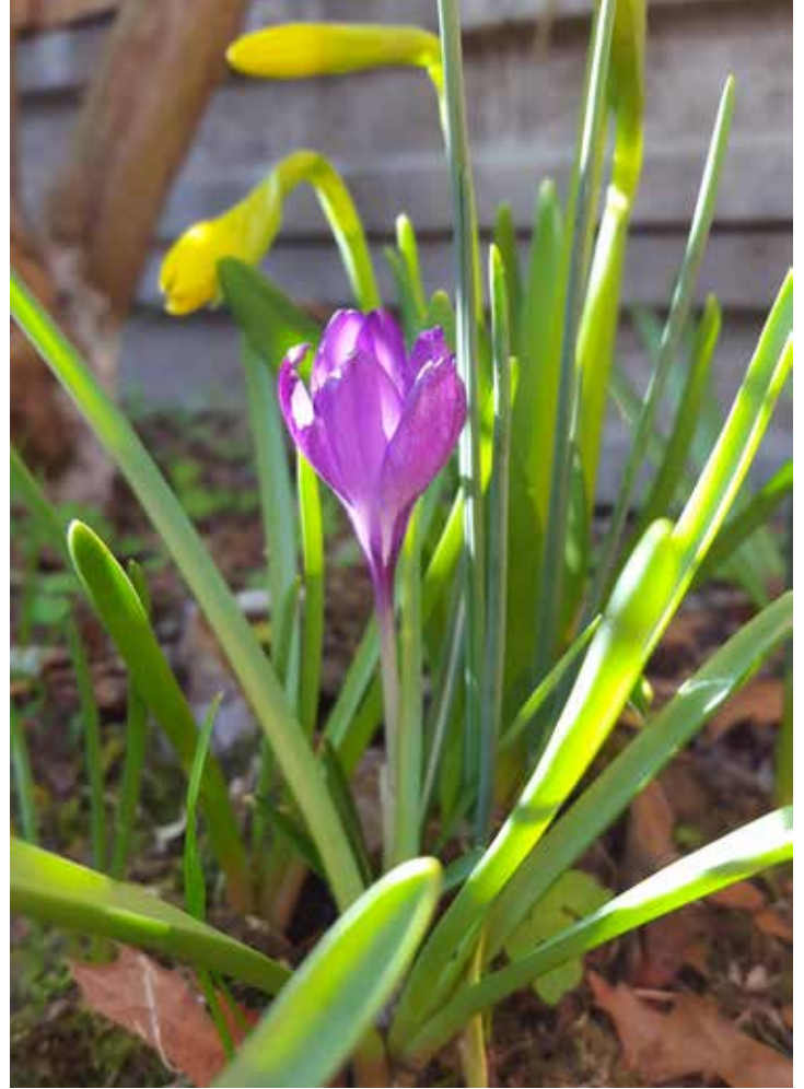
Spring Flowers - Wendy Dodson (2017)