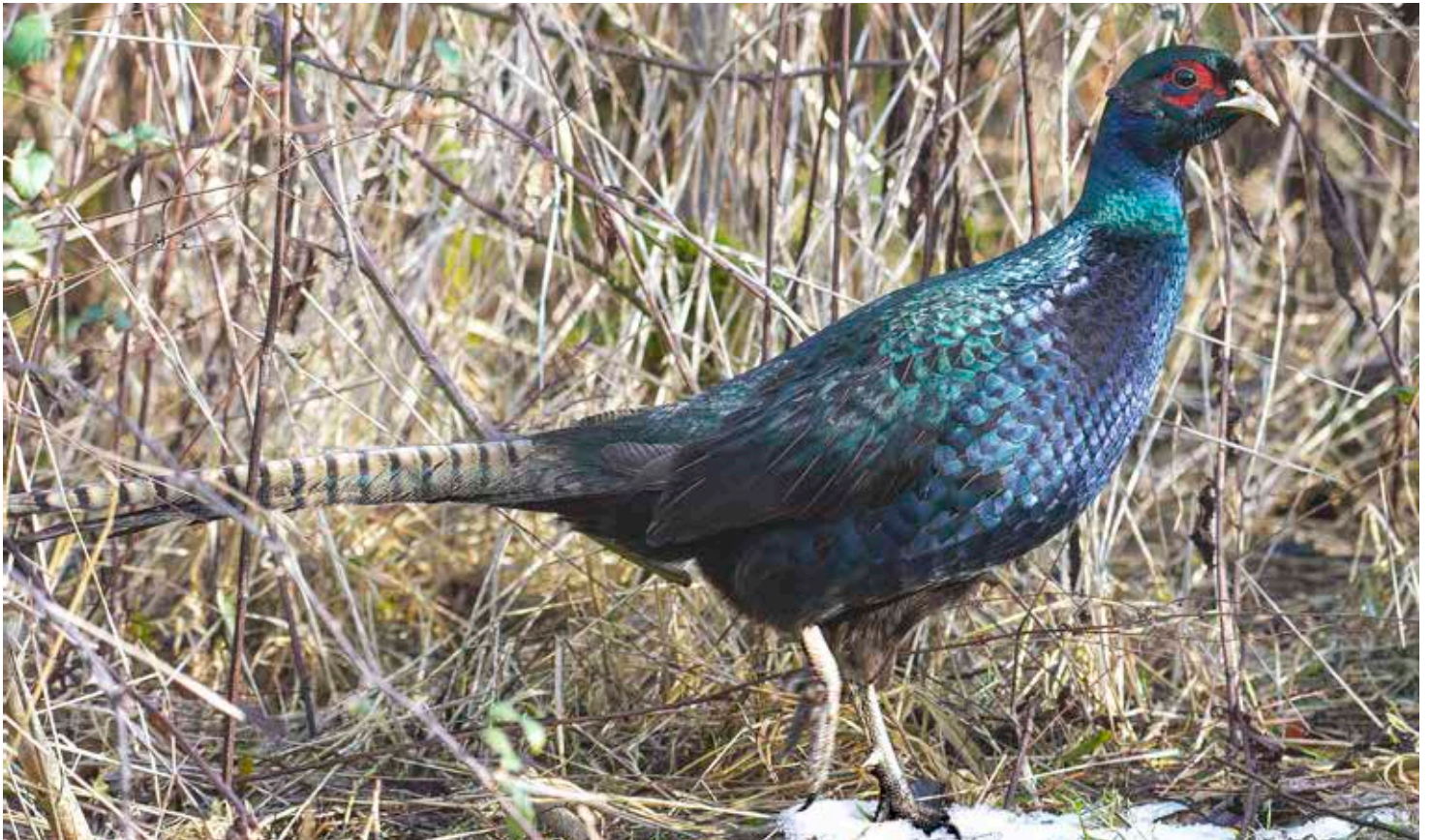
Colourful Pheasant - Papworth Woods - Pete Dobson (2019)