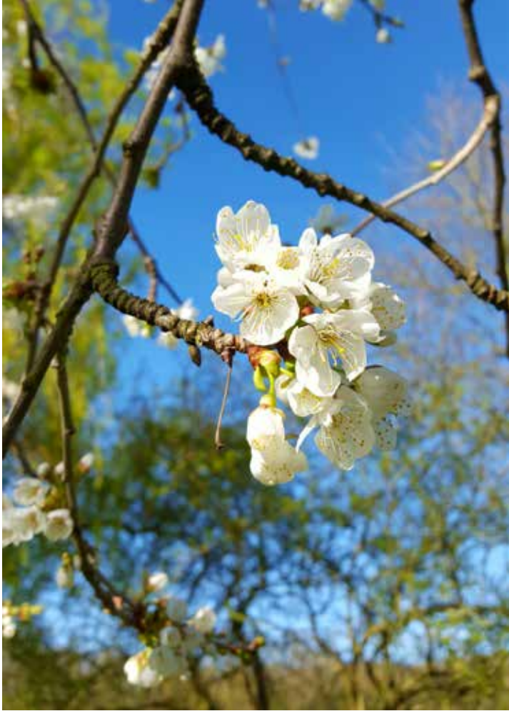
Spring Blossom - Wendy Dodson (2017)