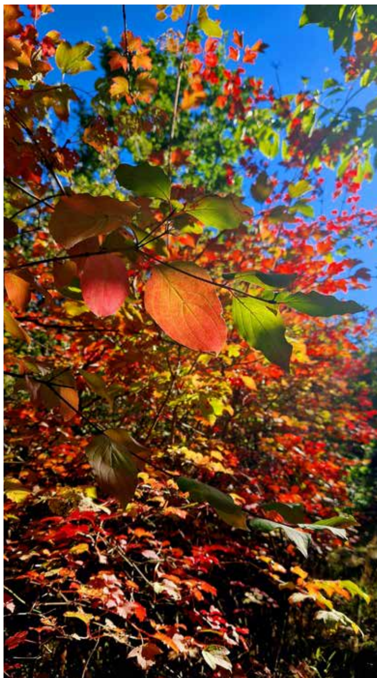
Autumn Colours - Stu Proudfoot

'Meetings with remarkable Trees' by Thomas Pakenham, published by Weidenfeld and Nicholson. This book captures the history and beauty of these entrancing living structures. Common to all these trees is their power to inspire awe and wonder. This is a lovingly researched book, beautifully illustrated with colour photographs, engravings and maps - a moving testimonial to the Earth's largest and oldest living structures.