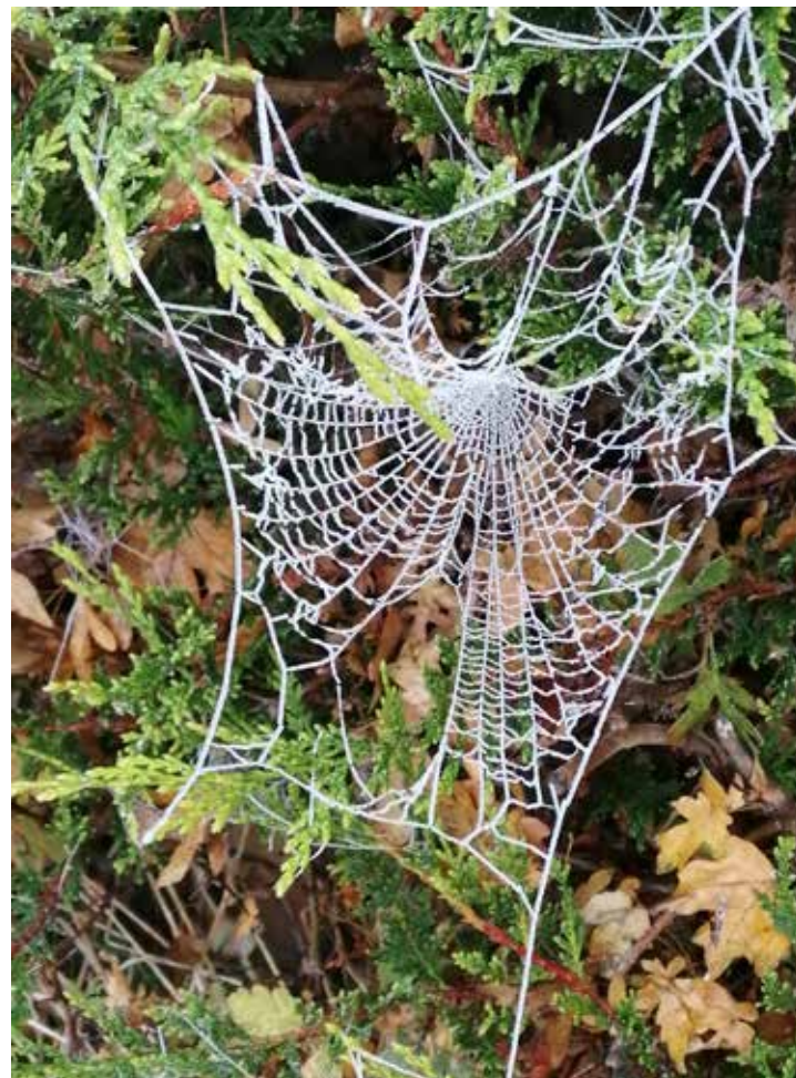
Frosty Webs - Phil Hill